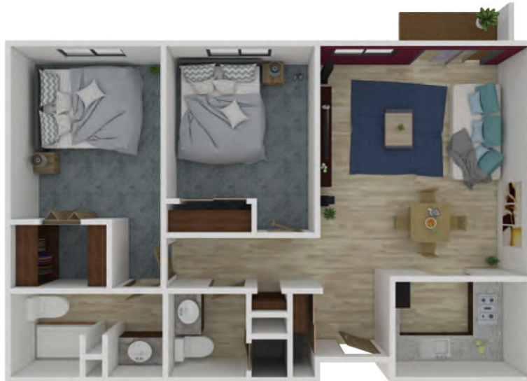
C Two Bedroom 905 SQ FT

Solstice Senior Living at Sun City West 18626 N. Spanish Garden Drive, Sun City West, AZ 85375 (855) 577-1380 SolsticeSeniorLivingSunCityWest.com