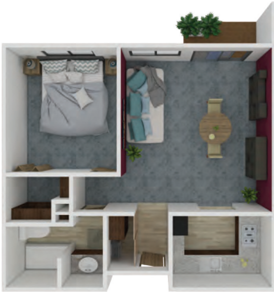
A One Bedroom 615 SQ FT

Solstice Senior Living at Sun City West offers several floor plan choices to suit your needs.