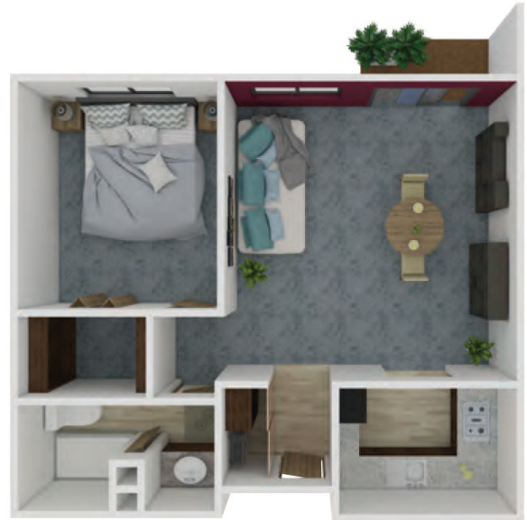
B One Bedroom 663 SQ FT